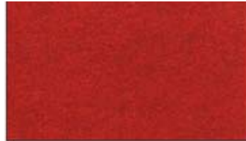
R11 Chili Pepper PMS 187C