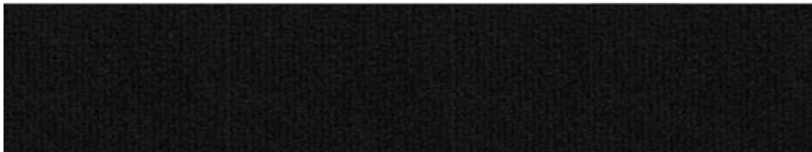
R01 Lava PMS 6C 2X

*FLAMMABILITY: Premier and Regal have been tested against local and international standards and have received the following results: