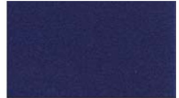
R04 Sapphire PMS 281C/282C