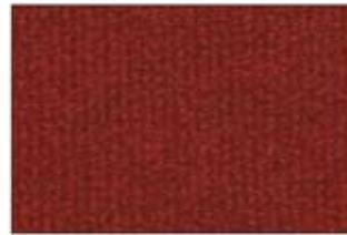
R08 Merlo PMS 195C