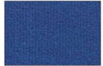
R06 Indigo PMS 294U