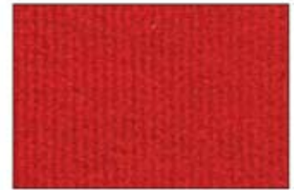
R11 Electric Red 187C