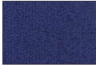
R04 Monarch PMS 281C/282C