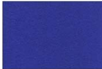
R05 Electric Blue PMS 296