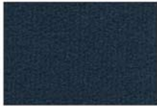
R12 Nebula PMS 2767C