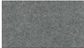
R03 Storm PMS 424C/425C