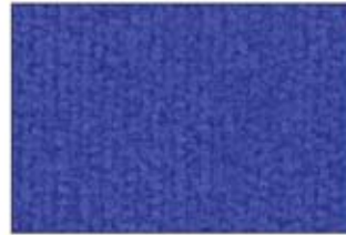
R05 Pacific PMS 280C