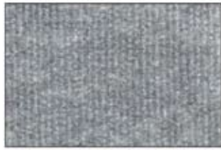
R02 Steel PMS 429U/430U