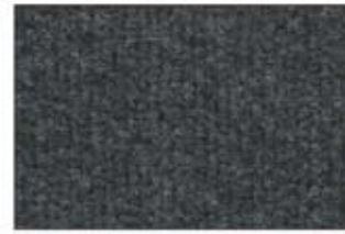
R15 Cinder PMS 426U