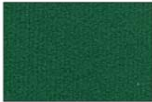
R09 Kelley Green PMS 3425C