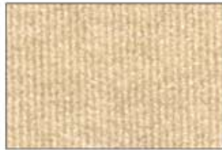
R07 Sand PMS 467U