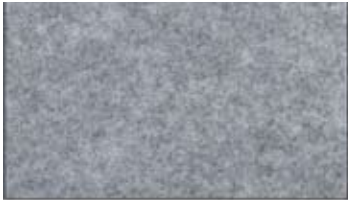
R02 Chrome PMS 429U/430U